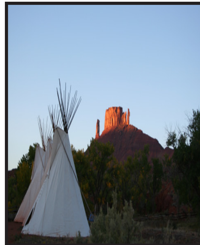
Tepees at Professor Valley Field Camp with Castelton Towers in background.